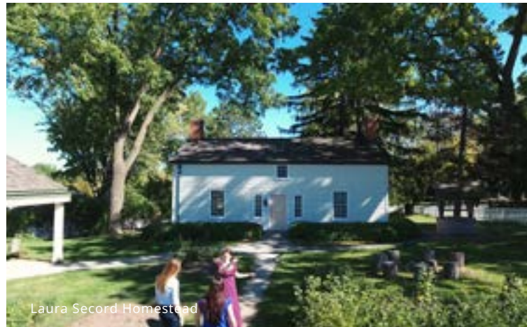
Laura Secord Homestead