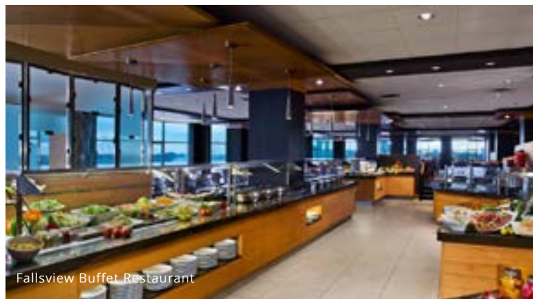
Fallsview Buffet Restaurant