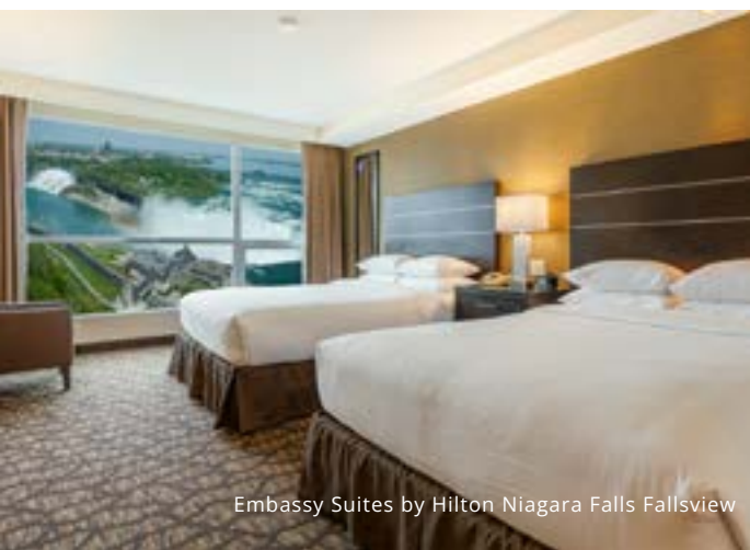
Embassy Suites by Hilton Niagara Falls Fallsview

Rest assured Niagara Falls has an accommodation to meet your every need.