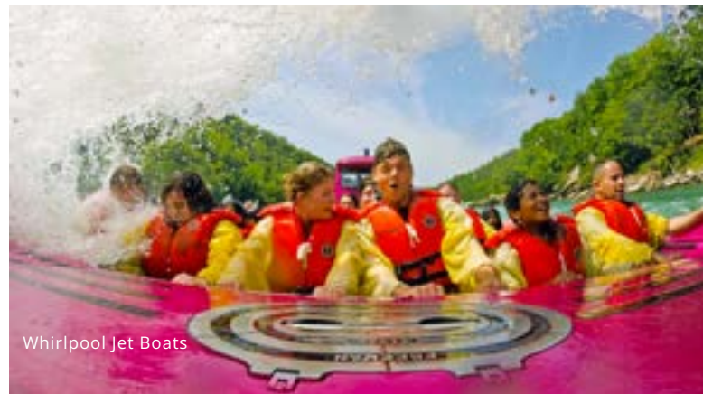
Whirlpool Jet Boats