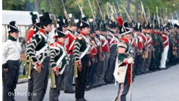
Old Fort Erie

Niagara roots also extend to the Underground Railway , as those escaping slavery were ferried across the Niagara River to safety. Visitors to the Niagara Freedom Trail can take in a collection of landmarks that highlight this important time. Explore our rich history of hydro electric power generation from the most towering turbine to the tiniest details, uncover fascinating stories hidden within the historic Niagara Parks Power Station .