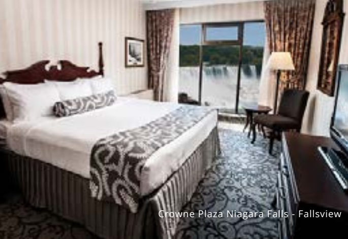
Crowne Plaza Niagara Falls - Fallsview