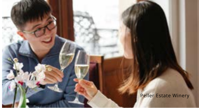
Peller Estate Winery

Beyond the grapes, explore the area's growing brewery and distillery culture. Wander the Niagara Ale Trail and sample pints at more than one of the local breweries, including award-winning Niagara Brewing Company on Clifton Hill. For the whiskey route, be sure to visit Wayne Gretzky Estates , a unique winery / distillery combo known for its handcrafted whiskey cocktails - a real game changer.