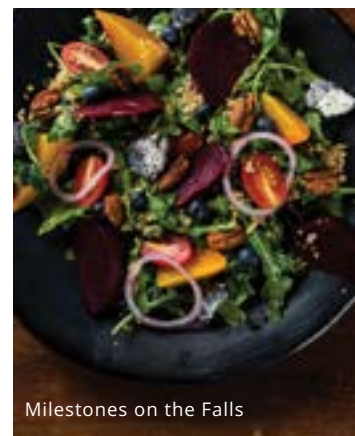
Milestones on the Falls