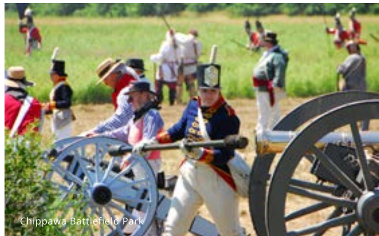
Chippawa Battlefield Park