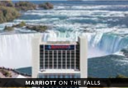
MARRIOTT ON THE FALLS