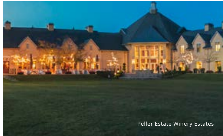
Peller Estate Winery Estates