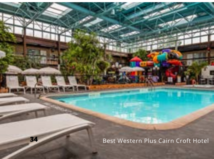
Best Western Plus Cairn Croft Hotel