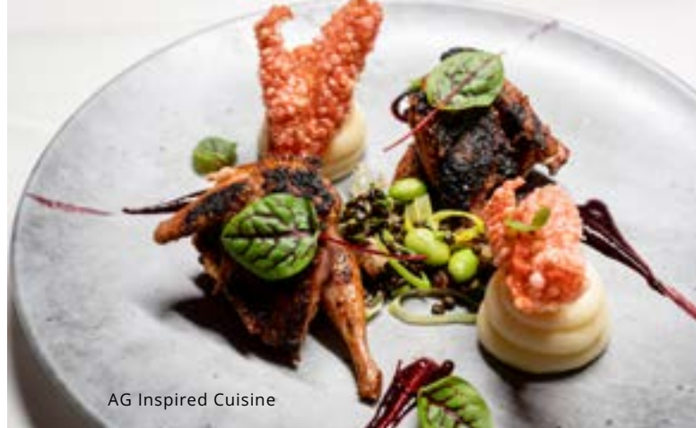
AG Inspired Cuisine

Guarantee a locally sourced meal when you choose a Feast On™ certified restaurant. This certification program recognizes commitment to sourcing Ontario grown and made food and drink, letting diners know they're supporting the Ontario food system and literally getting a taste of Niagara. Every Niagara Parks restaurant is certified, as well as Ravine Vineyard Estate Winery and Peller Estates Winery Restaurant making for plenty of great dining options!