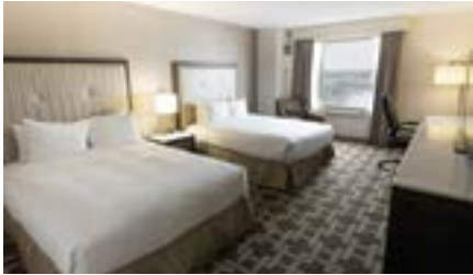
Elegant Guest Rooms