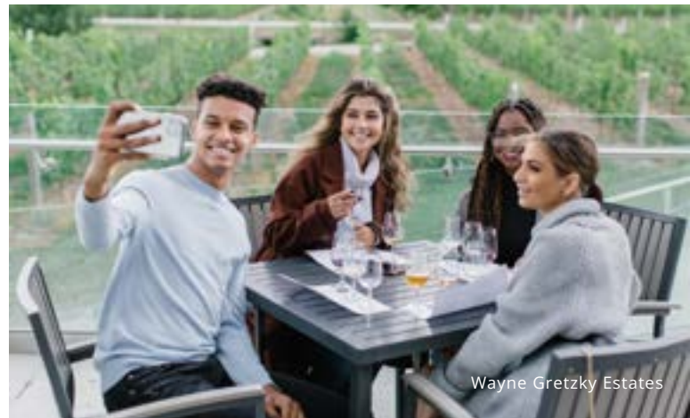
Wayne Gretzky Estates