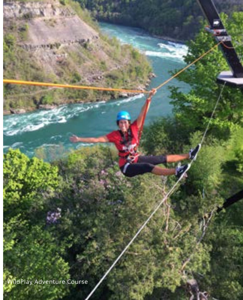
WildPlay Adventure Course

For golf enthusiasts, Niagara Parks offers three impressive Championship Courses to challenge players of any skill level. If golf's not quite your cup of tea, hike through the stunning Niagara Glen , or hop on two wheels and jet through the more than 300 kilometres of bike trails boasted by the region. Cap it all off with a stay under the stars at one of the many local campgrounds or cottage rentals across Niagara. Or find yourself up close to the Falls, with a getaway to one of the many incredible hotels and motels.