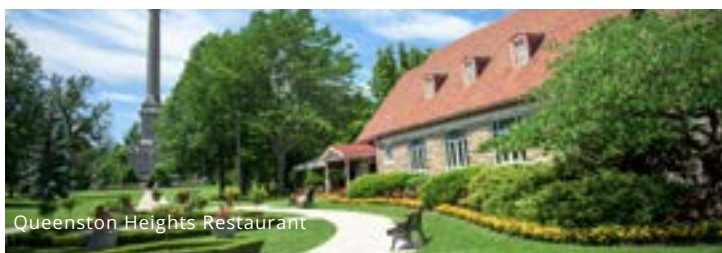
Queenston Heights Restaurant